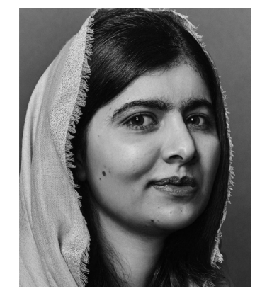
Malala Yousafzai Malala Fund